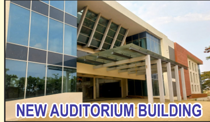
NEW AUDITORIUM BUILDING