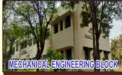
MECHANICAL ENGINEERING BLOCK