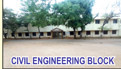
CIVIL ENGINEERING BLOCK