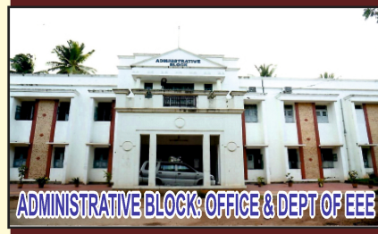
ADMINISTRATIVE BLOCK: OFFICE & DEPT OF EEE