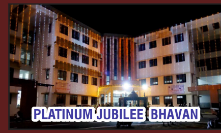
PLATINUM JUBILEE BHAVAN