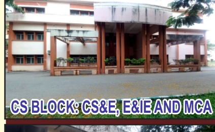
CS BLOCK: CS&E, E&E AND MCA