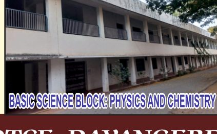
BASIC SCIENCE BLOCK: PHYSICS AND CHEMISTRY