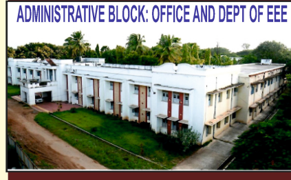
ADMINISTRATIVE BLOCK: OFFICE AND DEPT OF EEE