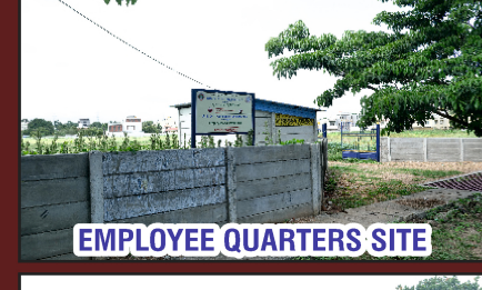
EMPLOYEE QUARTERS SITE